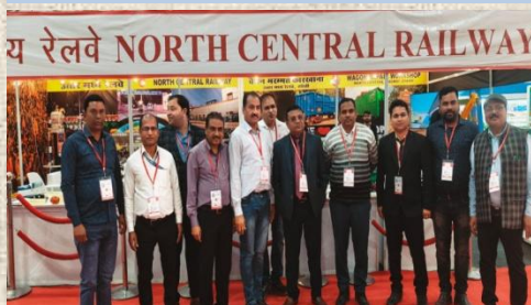
PARTICIPATION IN IIF/2025 AT RAJKOT