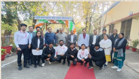
REPUBLIC DAY CELEBRATION AT STC/JHS