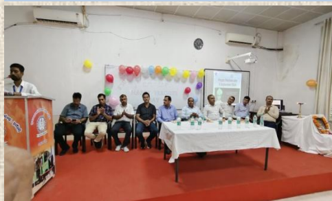
TEACHERS DAY CELEBRATION AT STC/JHS