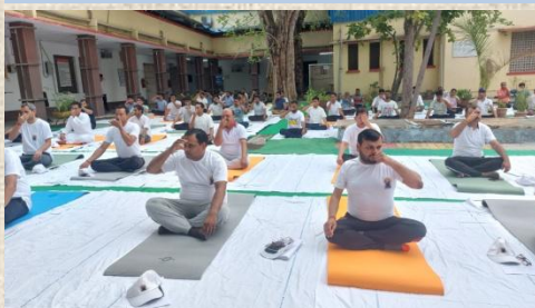
INTERNATIONAL YOGA DAY CELEBRATION AT STC/JHS