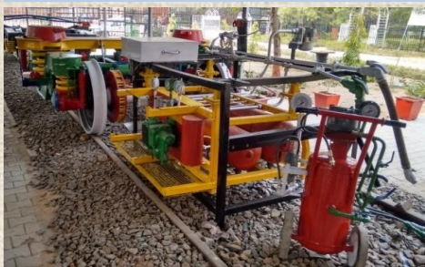
WORKING MODEL OF FIAT BOGIE WITH WSP